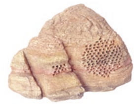
R6 in Sandstone

NEAR Rock Landscape Loudspeakers look like rocks, are shaped like rocks, and are even textured to feel like rocks. They are available in 8-ohm and 70V versions, in a 6" mid/bass driver in a horizontal orientation and an 8" mid/bass driver in a vertical orientation, and two color schemes: sandstone and granite.